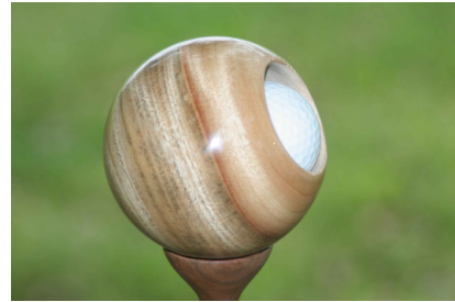
ultimate golfer gift, camphor

A ball in a ball is fun project that amazes everyone. A golf ball in a ball is a great gift for any golfer. Once you know the “secret” and have the skill to turn a natural edge bowl you can turn a Ball in a Ball. The smaller ball can be any round ball. A golf ball is an excellent choice for your first try. The golf ball is a bit more slippery than wood and goes in easier. Also it is a good size and turning a ball that small is more difficult than turning the larger ball.