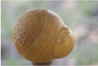
Ball in a ball, Osage Orange